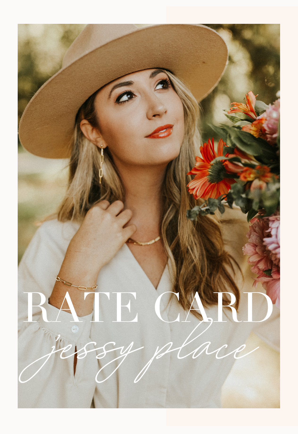
Boston-based Digital Content Creator