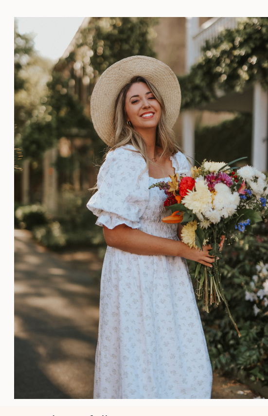
All images + video are professional produced. Hotels + Resorts have full marketing rights when partnering with me.